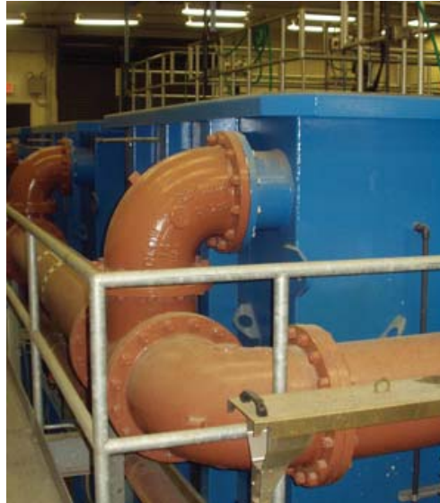
HRC designed a tertiary treatment system never before used in a wastewater treatment application in Michigan, using Enhanced High Rate Clarifiers, commercially named Actiflo®.