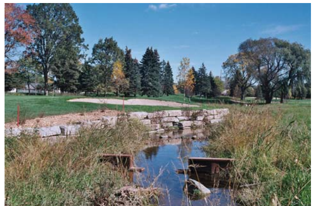
Sylvan Glen Golf Course Weir and Streambank Stabilization

An American Public Works/Michigan Chapter (APWA/M) 2006 Project of the Year Award in the Environment Less than $2 Million category, and the American Society of Civil Engineers Southeast Michigan Branch (ASCE/M) Quality of Life Project of the Year Award were earned as a result of the innovative approaches to the streambank restoration on the Sylvan Glen Golf Course. Constructed in 1922, the Course is owned by the City of Troy and has experienced severe impacts