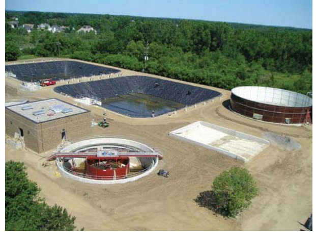
City of South Lyon Wastewater Treatment Plant

The City of South Lyon Wastewater Treatment Plant Improvements project earned the prestigious Honorable Conceptor Award from the American Council of Engineering Companies/Michigan (ACEC/M), the 2006 Project of the Year Award in the Environment, $10 million to $100 million category from the American Public Works Association Michigan Chapter (APWA/M), and the American Society of Civil Engineers Southeast Michigan Branch (ASCE/M) Outstanding Civil Engineering Project of the Year Award .